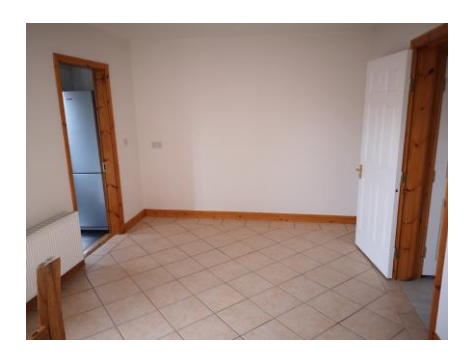
Tiled Floor, Radiator, Double Doors to Rear Garden.