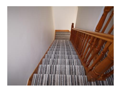
Teak Front Door, Pine Carpeted Stairs, Tiled Floor, Radiator.