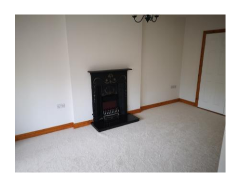
Fireplace with Cast Iron Surround and Fire Inset, Large Bay Window with Blinds, Carpets, Radiator, Light Fittings, Double Doors to Dining Room