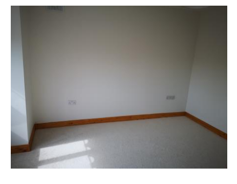
Master Room: Large Bay Window with Blinds, Radiator.