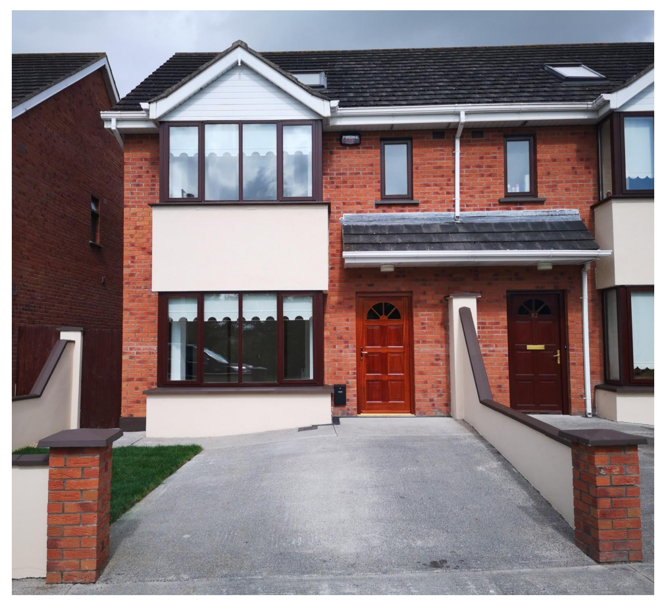
FOR SALE BY PRIVATE TREATY