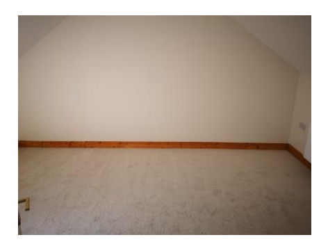
Top Floor Carpets, Radiator, Access to Storage Attic