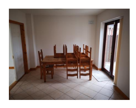
Dining Room/Family Room